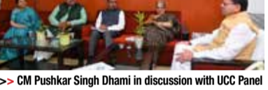
>> CM Pushkar Singh Dhami in discussion with UCC Panel

PROMOTING SOCIAL HARMONY In a diverse state like Uttarakhand, where different religious and ethnic communities coexist, the UCC would reinforce the principle that all citizens are equal before the law, thus promoting a more harmonious and integrated society.