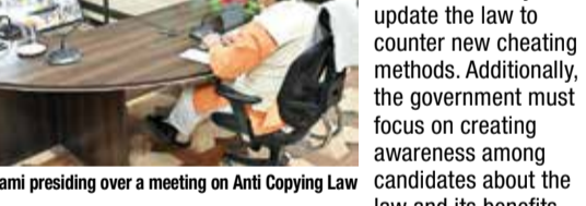
>> CM Pushkar Singh Dhami presiding over a meeting on Anti Copying Law

more individuals to pursue government jobs, knowing that the selection process is unbiased and transparent. Long-term benefits: A transparent and fair recruitment system attracts more qualified