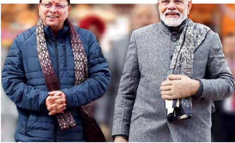
>> Narendra Modi, Prime Minister of India and Pushkar Singh Dhami, CM Uttarakhand

The proposed law has 392 sections divided into four parts and seven chapters providing equal rights to women in marriage, divorce, alimony, and inheritance of property, proscribes certain kinds of relationships, bans polygamy, sets the marriageable age for men and women (21 years and 18 years respectively), and makes registration of marriages mandatory