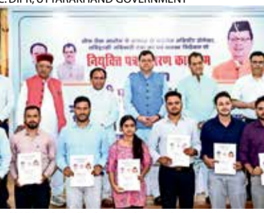
>> CM Dhami distributing appointment letters

the neck of the cheating mafia? I knew an attempt would be made to intimidate us after we decided to act against the mafia involved in the paper leak. I would like to know in whose government's tenure the accused were sent to jail," Dhami said. CM Dhami further said, "It will also